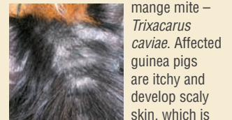
Trixacarus caviae . Affected guinea pigs are itchy and develop scaly skin, which is

Skin problems may occasionally occur and the most common of these is an infestation with a burrowing mite –