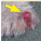
A grass seed has become lodged between the toes in a dog causing an interdigital cyst

Grass awns of the meadow grasses are an issue at this time of year. They are commonly trapped in dogs' ears (see article right), and may also become embedded in the feet (see photo left) or other areas. In view of this, thorough inspection of the coat is advisable following walks.