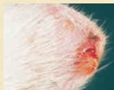
Ear tip of a cat with early (reddened) cancerous changes. If your pet is showing signs of skin changes, please call us at once

Factor 50! Cats are natural sunbathers and for many cats this causes no problems. However cats with white ear tips and noses are prone to sunburn and this can lead to cancerous changes over time. High factor sun block applied to the at-risk areas helps to minimise this risk. Call us if you are worried.