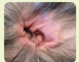
Opening to the vertical ear canal in a dog showing redness and itchiness typical of allergic skin disease